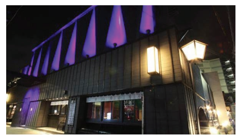
The "KYOTO, NINJA", the venue of YS night out

Notice: Registration is needed to attend the YS night out, and we offer 3,000 JPY per person as participation fee. Please visit the registration site (https://goo.gl/forms/wu8wmZpOfdqBaXaq1) for details