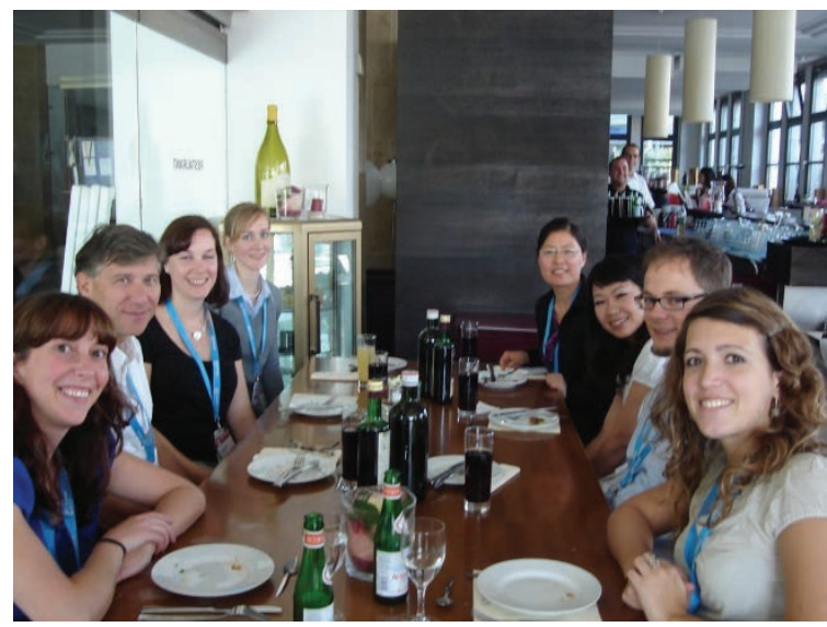
YS lunch at IATDMCT 2011, Stuttgart