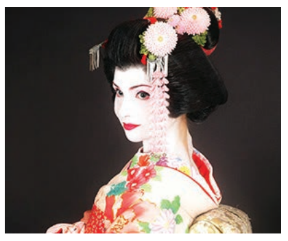
Exotic experience of Maiko girl

The major taxi companies in Kyoto are Yasaka Taxi and MK Taxi. Both Taxi companies provide service with an English-speaking driver. You can use a taxi for private sightseeing or business transportation. The relevant details are shown at the following websites.